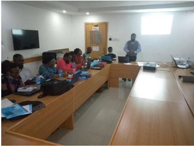
Figure 2: A cross-section of participants of the training for Security Agents in Enugu

(DSS) and Economic and Financial Crimes Commission (EFCC) among others.