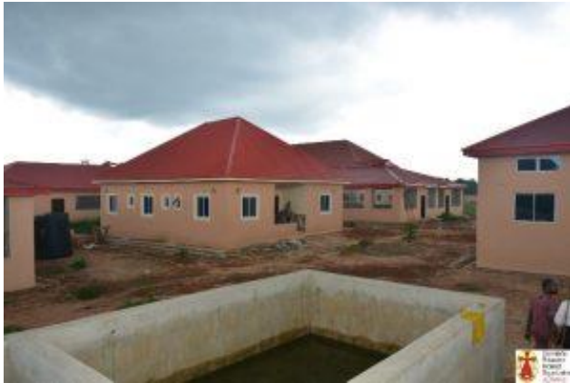
Fish ponds and back view of farm house