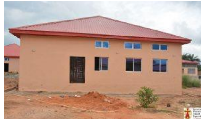
External and internal view of the