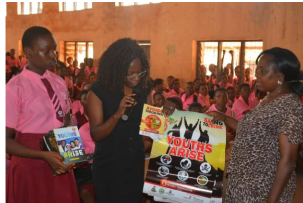
CAPIO Staff presenting IEC Materials during In- School Crime Prevention Sensitization Campaign at Idaw River Girls Secondary school Enugu

Carmelite Prisoners' Interest Organization (CAPIO) in 2020 continued a 2017 Misean Cara funded project geared towards mobilizing vulnerable youths in Enugu state against criminal activities. 2020 happened to be the third and final year of the project, emphasis was on completing in-school sensitization visits, media campaigns as well as evaluating the project and developing sustainability plan for the Campaign Against Crime project.