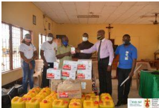
Presentation of PPEs and medications in Awka

While Radio and TV recordings could be accessed through the following links respectively https://bit.ly/37Kmfni and https://bit.ly/34A7IOU