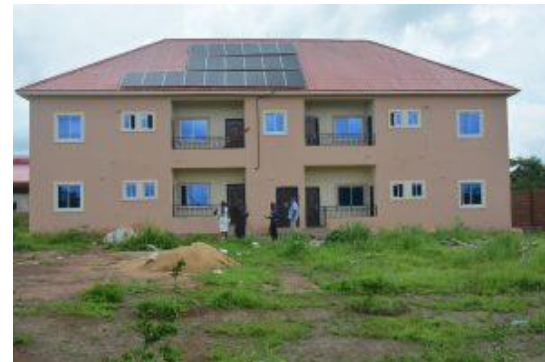
Front view of the Centre of Hope staff quarters