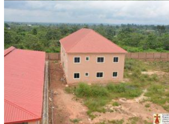
Aerial view of the staff quarters