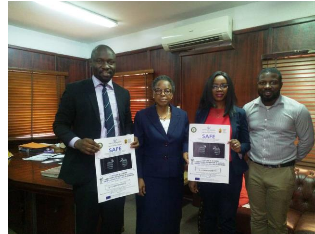
Figure 1: SAFE Team in a group photo with the Admin Judge (representing the Chief Judge of Lagos State)

held on the 26 th - 28 th February 2020 in Lagos State, and on 12 th – 14 th October in Enugu State.