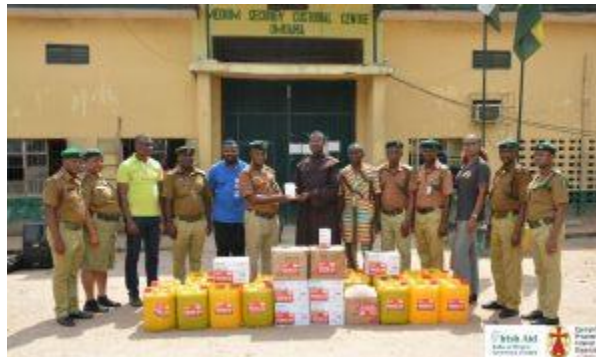
Presentation of PPEs and medications in Umuahia