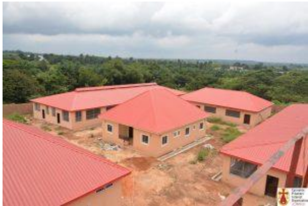
Aerial view of Farm Office Building, Poultry (layer and broiler pens), brooding and egg store