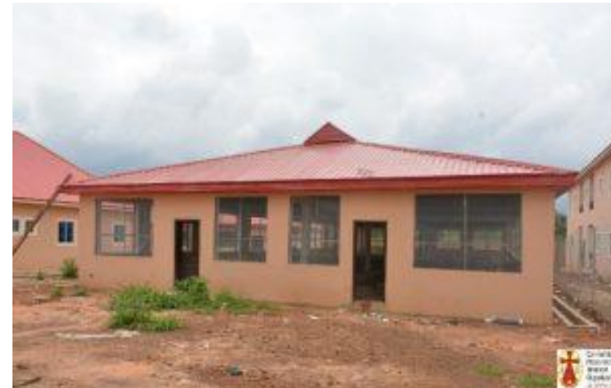
External view of the Poultry building (broiler section)