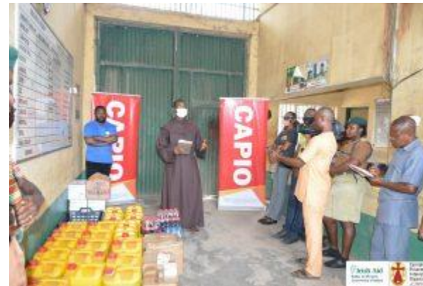
CAPIO team addressing Inmates and Correctional Officers